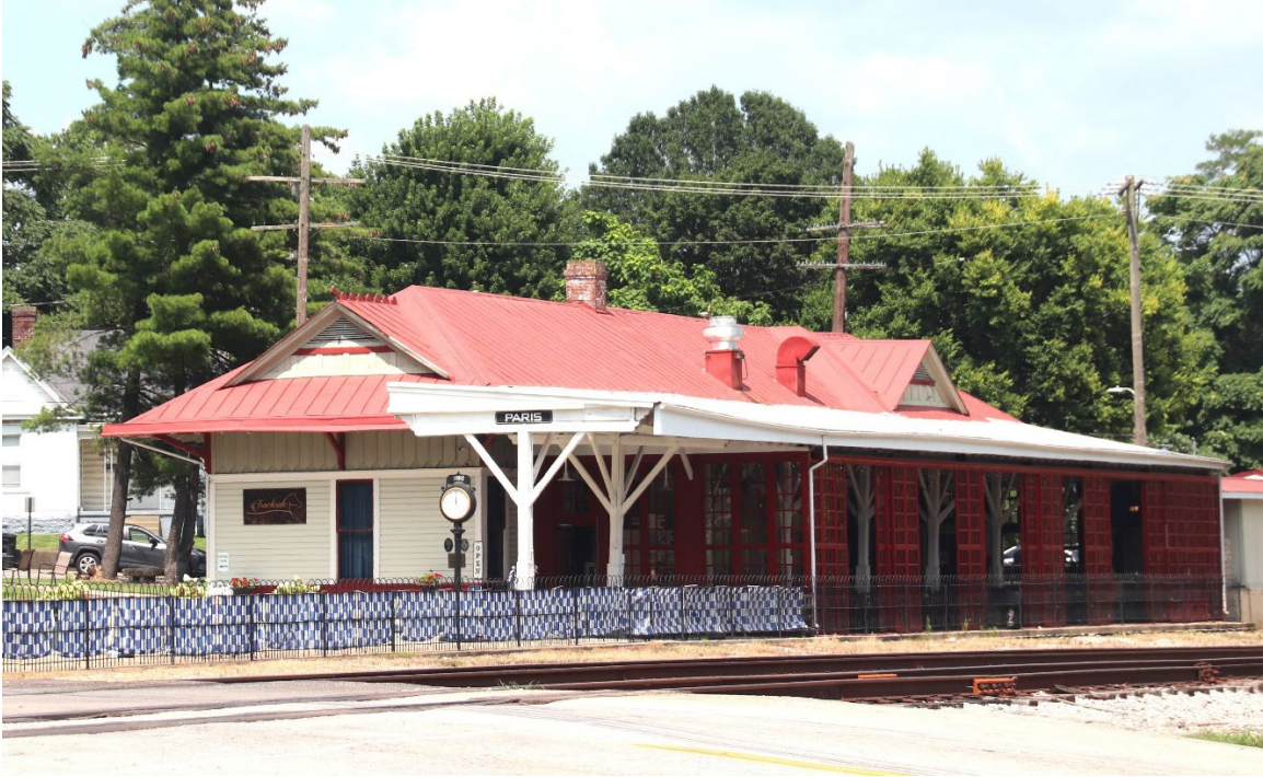
The former Paris Kentucky Depot is now Trackside Restaurant & Bar