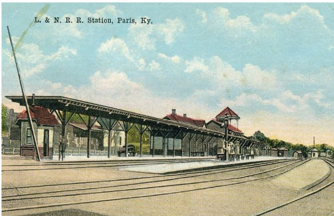
Paris Depot circa 1910.