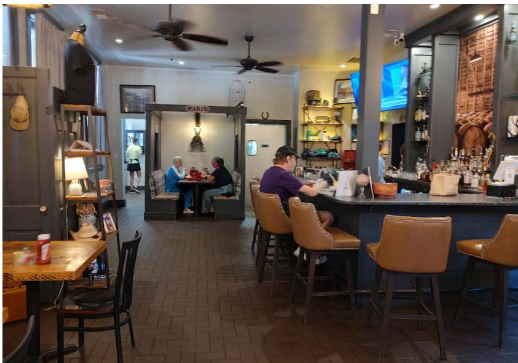
The inside bar area.