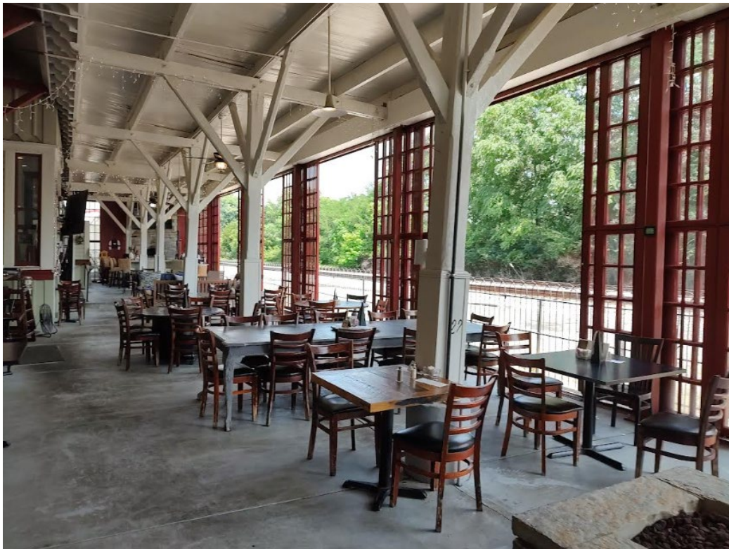
The trackside indoor/outdoor seating area.